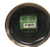
Internal View - 2 pin Terminal Block