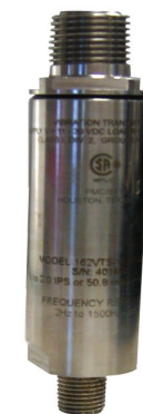
Full Body View